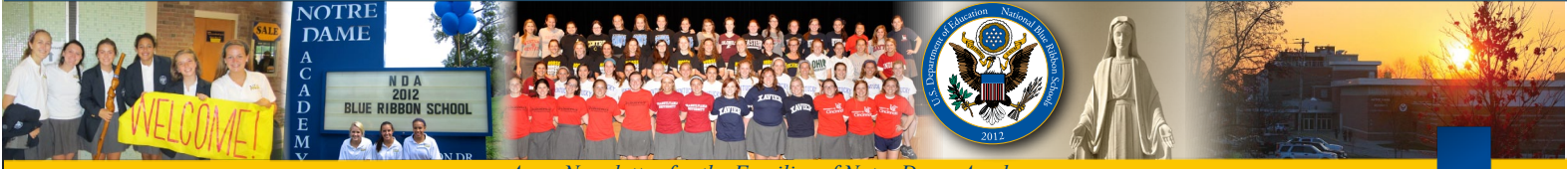
An e-Newsletter for the Families of Notre Dame Academy